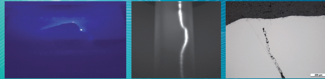
Left: Railway with squat (inclined crack); Middle: Covered crack in a steel profile; right: Covered crack in the micro-section