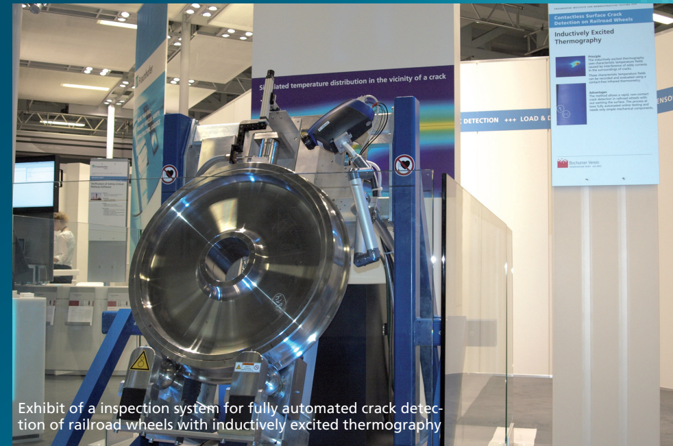
Exhibit of a inspection system for fully automated crack detection of railroad wheels with inductively excited thermography

Sensor and Data Systems for Safety, Sustainability and Efficiency