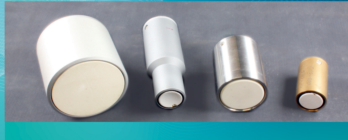
Selection of air-coupled ultrasound probes on hand

By specific modifications the efficiency and the features of the ultrasound electronics available at Fraunhofer IZFP for conventional ultrasound inspection were adapted for