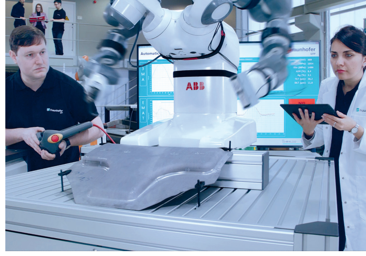
Testing CFRP components using sampling phased array